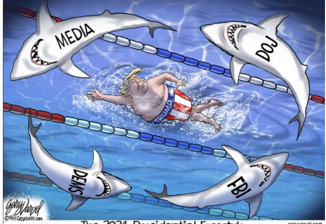
The 2024 Presidential Freestyle

Biden's approval rating just keeps falling. Over his Presidency food has risen 20+%, rent +20%, electric +28%, public transportation + 20.8% and real wages -4.2%. This data is his Achilles heel. Democratic party strategy has also gone AWOL.